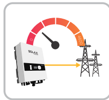
Export Control to the Grid