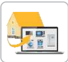
Load Remote Control