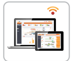
Internal WIFI & Remote Monitoring